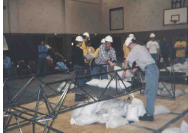
Loading the steel bridge at Grand Forks