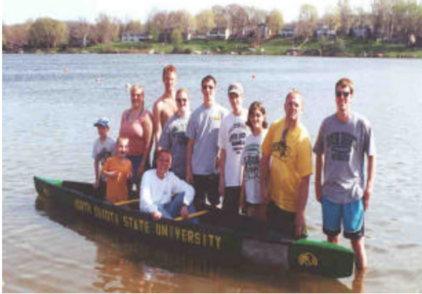
Concrete canoe competition at Iowa City